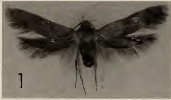
FIG. 1. Holotype of Hypatopa tapadulcea Adamski.

culum a thin band; juxta entire, not divided; lower part of valva with marginal setae, distal part setose, tapered to a pointed apex; upper part of valva with a subrectangular sacculus; sacculus with mostly stout setae intermixed with hairlike setae, a small cluster of microtrichia near outer margin at base of long, setose digitate process; aedeagus bulbous at base, parallel sided to apex; anellus setose. Female genitalia (Fig. 4): ovipositor telescopic, in four membranous subdivisions; ostium elongate, delimited within membrane